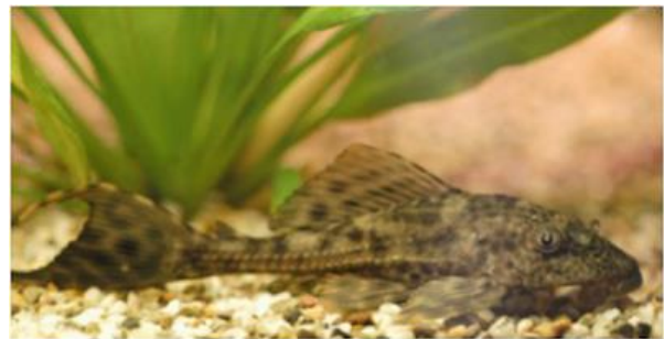
In the aquarium.

Also known as a “suckermouth”, “algae eater” or “armored catfish”, the Plecostomus is another example of an aquarium fish that was released into the wild and has grown out of control. They are voracious consumers of aquatic plants and wood, and contribute significantly to erosion in areas of infestation. They also create deep burrows under banks, which cause undercutting and bank collapse. What seems harmless in your tank can be a major threat to the ecosystem outside of it.