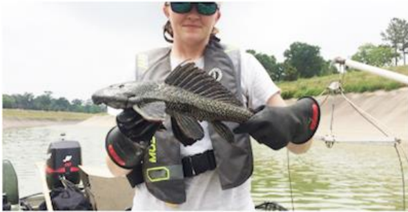
Released in the wild.